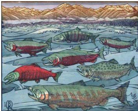
Bill Reiswig (Olympia, WA), Seven Spawning Salmon Species Swimming Salish Seas , 2017, woodblock print, edition: 29/67, 8" x 10"; Collection of Maryhill Museum of Art