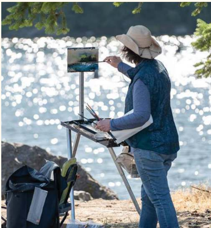
An artist working en plein air along the Columbia River.