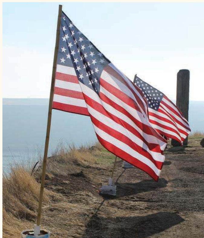
Last year's Armistice Day Remembrance at Stonehenge Memorial.

In partnership with the Society of the Tomb of the Unknown Soldier, Maryhill Museum of Art will remember those who have made the ultimate sacrifice. At 11 a.m., we will join the nation for ringing of the bells at the museum.