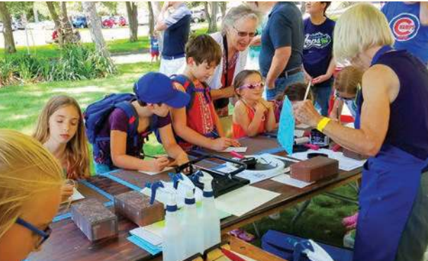
Volunteers assisting with the printmaking during the print day for the Exquisite Gorge Project.