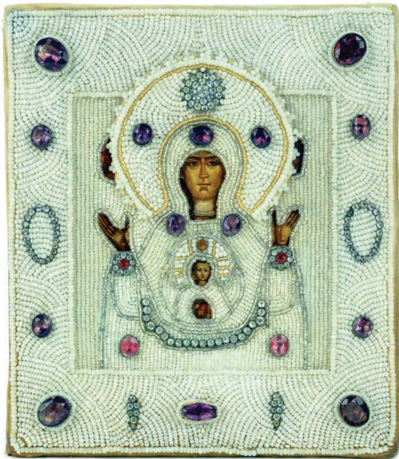
Unknown Russian artists, Icon of the Mother of God of the Sign (Platytera) with beaded riza, c. 1800-1850, tempera on wood panel and glass beads, 9" x 8"; Collection of Maryhill Museum of Art