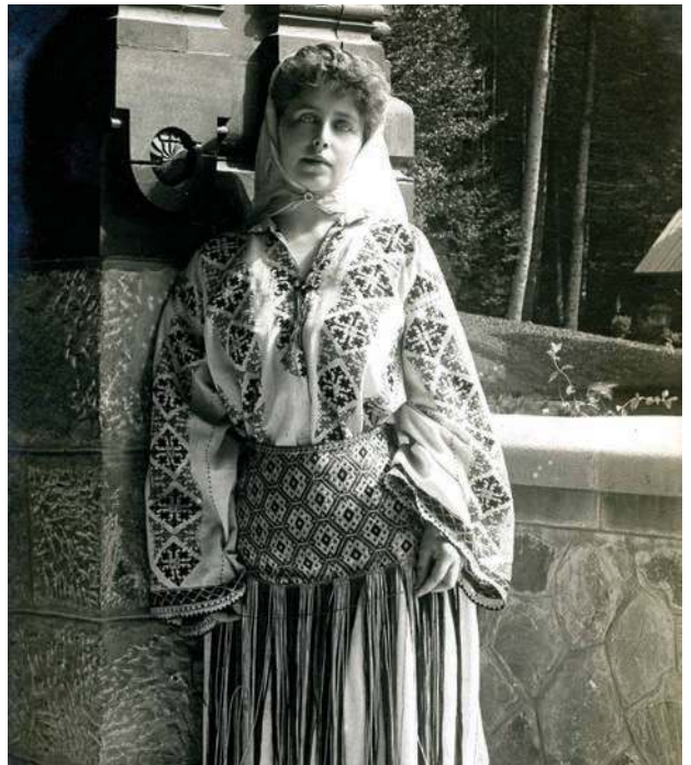
Princess Marie in traditional Romanian costume

When she was Romania's crown princess (1893–1914), Marie of Edinburgh (later Queen Marie of Romania) began wearing peasant-inspired clothing from the country's eastern provinces — a fashion trend long promoted by Elisabeth of Wied, Queen of Romania, and her court. A Particular Beauty draws from Maryhill's collection of more than 450 Romanian clothing and textiles. The display will include about 20 fully dressed female mannequins, numerous individual garments such as coats, vests, shirts and blouses, as well as bags and other personal accessories.