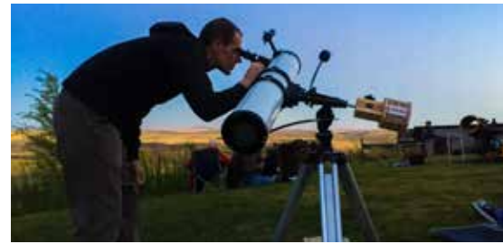
Starry Night at Maryhill.