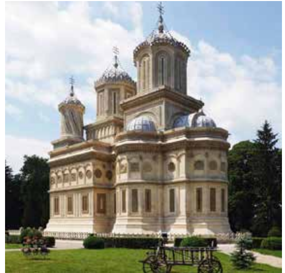
Bishopric Palace in Curtea de Argeș, designed by Andre Lecomte du Noüy.