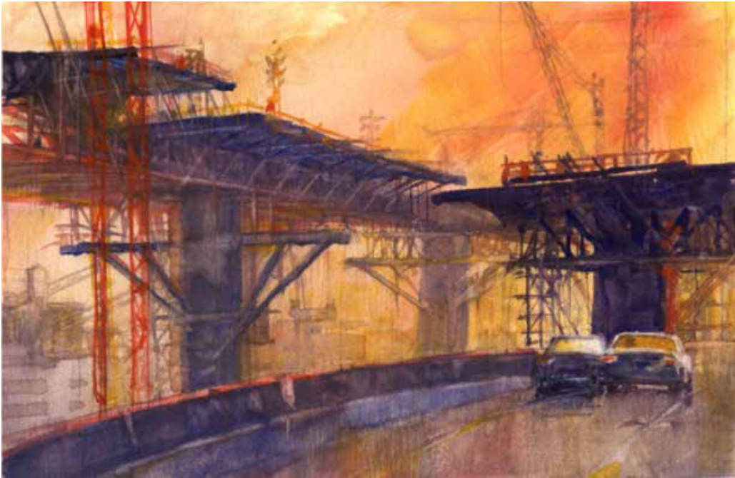
William Hook (American, b. 1947), Highway Work Study 1 , 2017, watercolor on paper; Museum purchase, Collection of Maryhill Museum of Art