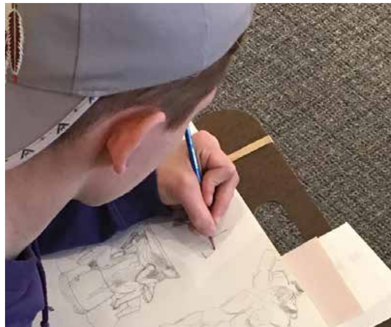
Student working in the Rodin Gallery at the High School Museum Day this spring.