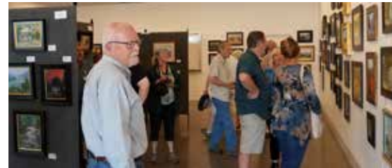
Pacific Northwest Plein Air Event at Maryhill.