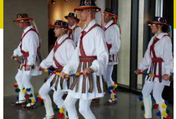
Romanian Folkloric Ensemble Datina practicing at Maryhill in 2016 prior to one of their performances.