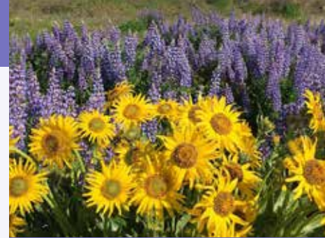
Wildflowers on the grounds.

We have made every effort to ensure the accuracy of this list. If there is a mistake, please accept our sincere apologies and contact us so we may correct. This list includes gifts from January 1 through August 14, 2018.