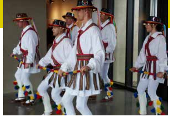
Romanian Folkloric Ensemble Datina practicing at Maryhill in 2016 prior to one of their performances.