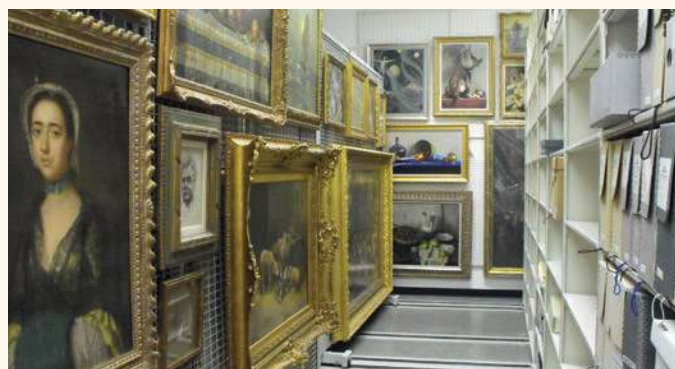
Collections Storage in the Brim Family Research Center.

From collections, to scholarship, exhibitions and educational outreach, this is your chance to learn about the many wonderful things happening at Maryhill; we'll also share some of our plans for the future.