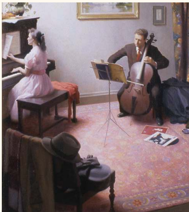
Richard F. Lack (American, 1928–2009), The Concert , 1961, oil on canvas, 29" x 27" (framed); Collection of Maryhill Museum of Art