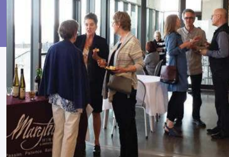
A members' reception at the museum with the Maryhill Winery in 2016.

We have made every effort to ensure the accuracy of this list. If there is a mistake, please accept our sincere apologies and contact us so we may correct.