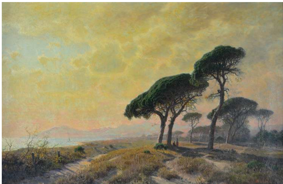
William Stanley Haseltine (American, 1835–1900), Stoney Pines, Cannes , c. 1880s, oil on canvas, 23" x 36-1/2"; Gift of Helen Haseltine Plowden, Collection of Maryhill Museum of Art

This exhibition showcases landscape paintings from the museum's collection, including historic and contemporary European and American works, and recent paintings from the 2016 and 2017 Pacific Northwest Plein Air in the Columbia River Gorge events.