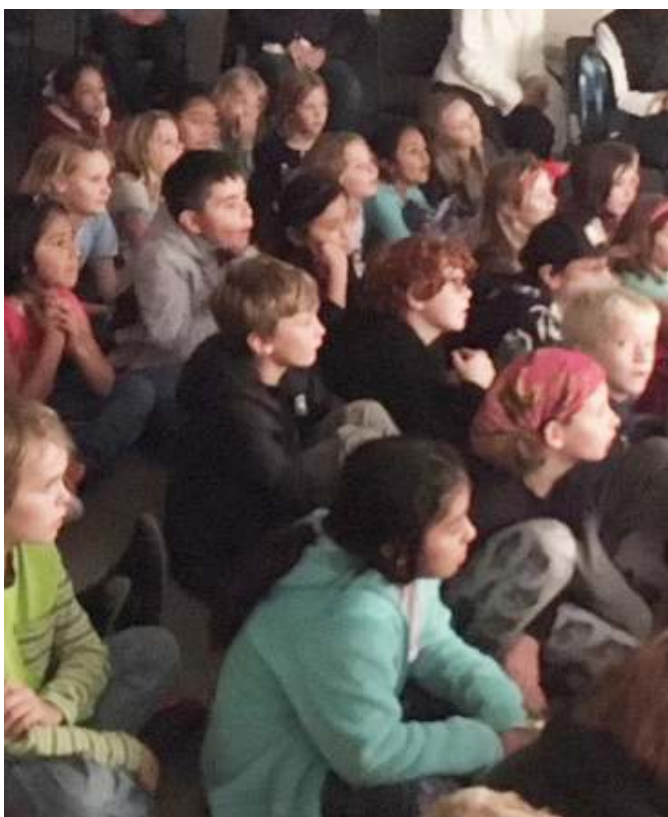
Students watching intently during last year's shadow puppet play at Maryhill's Museum Week.