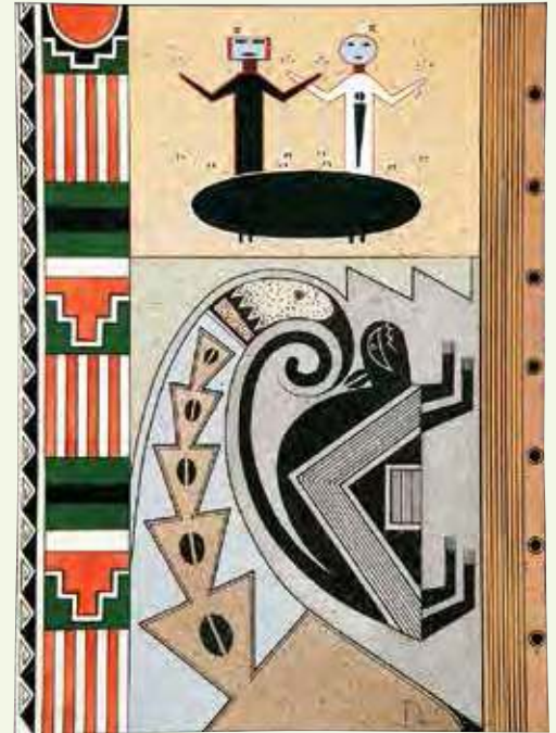
Anthony Edward "Tony" Da (San Ildefonso Pueblo, 1940–2008), Symbols of the Southwest , 1970, tempera on paper, 19½" x 14¾"; Arthur and Shifra Silberman Collection, National Cowboy & Western Heritage Museum, Oklahoma City, OK.

Black and white prints showing both construction of the highway and early scenic views of the Columbia River Gorge.