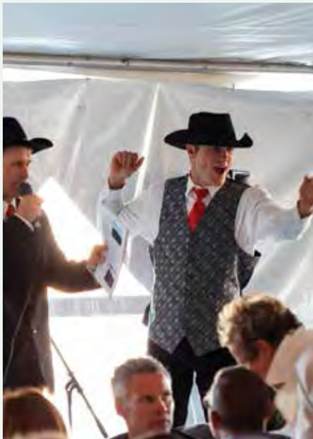
Auctioneers making a sale at the museum's 2014 benefit auction.