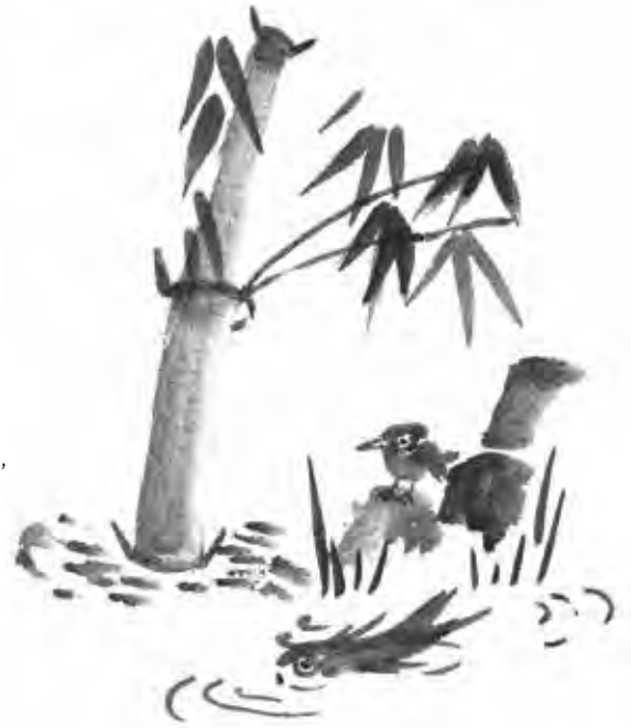
Sumi-e painting by Margaret Burkhart.

Cost (includes refreshments): $35 members / $40 non-members; to register call 509.773.3733 ext. 25.