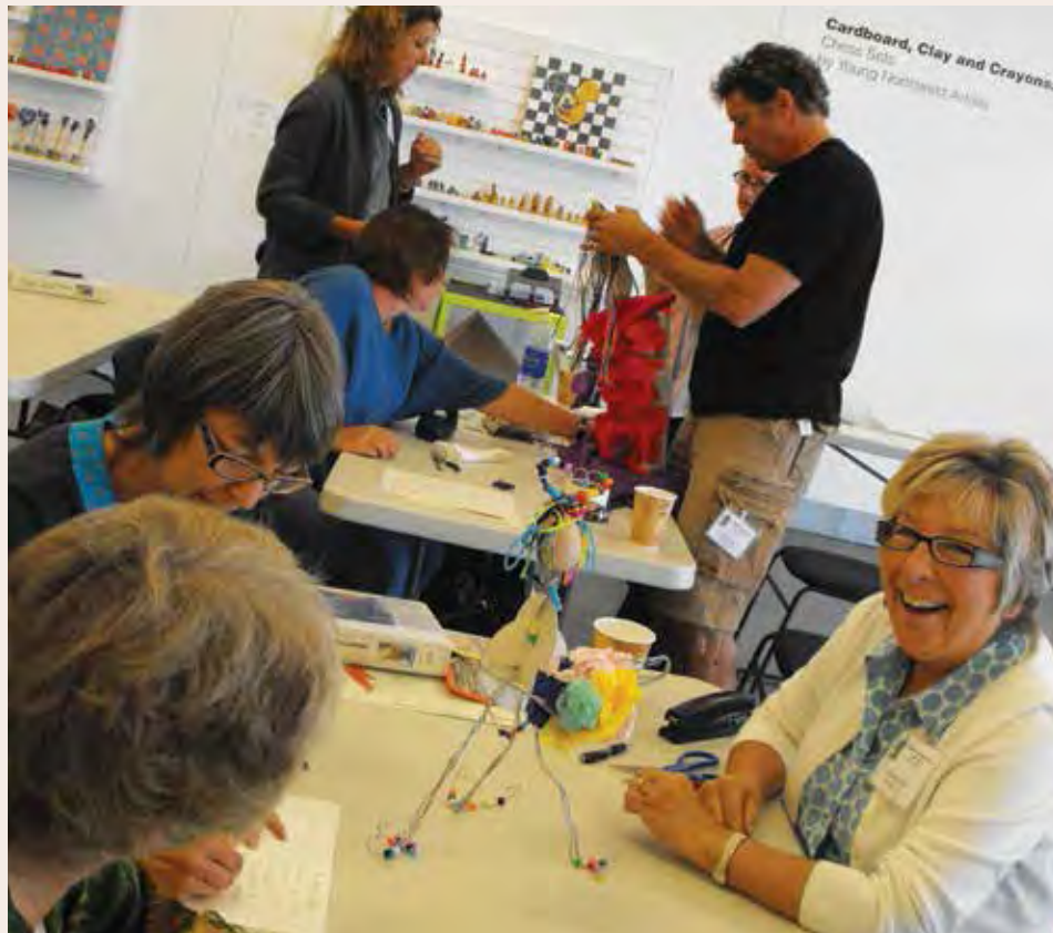
At last year's Summer Art Institute participants learned about sculpture.

This five-day intensive program will strengthen your knowledge of art while integrating the visual arts into your lives—where you work, live and play. This year, we will focus on the power of paper—how it changed the way we communicate, keeps our stories, records our thoughts and gives our imaginations room to grow. Throughout the week we will explore works on paper from the written and printed word to dynamic visual expressions in pencil, pen, paint and much more. Through lectures, gallery talks, discussion groups, and hands-on activities, participants in the Summer Art Institute will analyze how people use paper to create works of art that touch our minds and hearts. The Institute is led by Maryhill's executive director, Colleen Schafroth and co-taught with poet Tim Barnes; the institute will also feature guest artists.