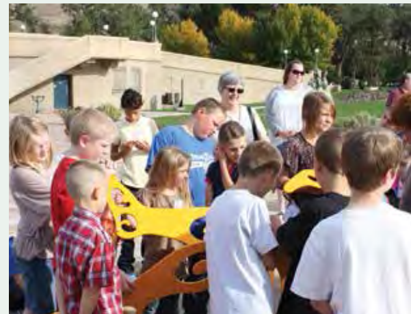
Learning about sculpture during a 2014 Museum Week program.