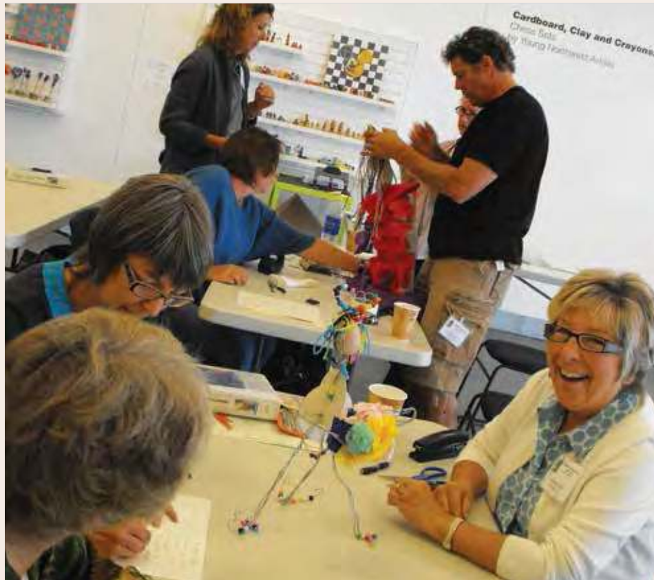
At last year's Summer Art Institute participants learned about sculpture.

This five-day intensive program will strengthen your knowledge of art while integrating the visual arts into your lives—where you work, live and play. This year, we will focus on the power of paper—how it changed the way we communicate, keeps our stories, records our thoughts and gives our imaginations room to grow. Throughout the week we will explore works on paper from the written and printed word to dynamic visual expressions in pencil, pen, paint and much more. Through lectures, gallery talks, discussion groups, and hands-on activities, participants in the Summer Art Institute will analyze how people use paper to create works of art that touch our minds and hearts. The Institute is led by Maryhill's executive director, Colleen Schafroth and co-taught with poet Tim Barnes; the institute will also feature guest artists.