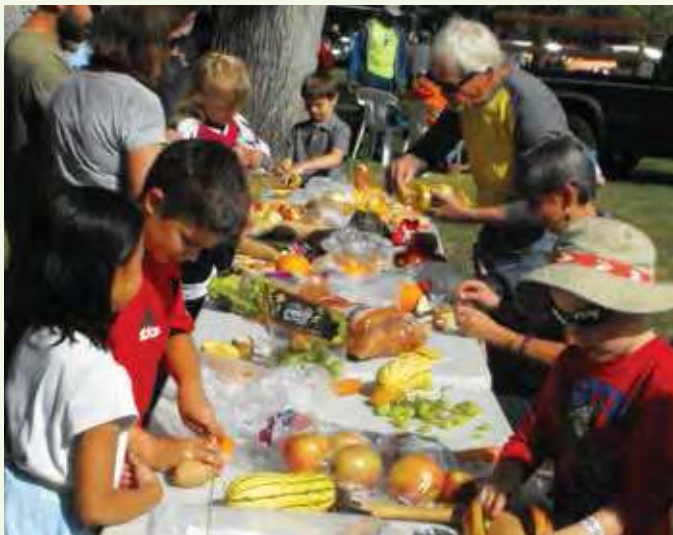
Fun making veggie cars during Car is King Weekend at Maryhill Museum of Art.