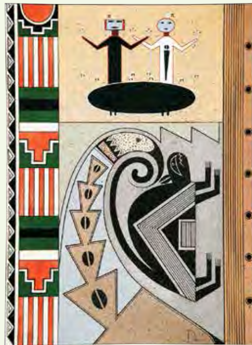
Anthony Edward "Tony" Da (San Ildefonso Pueblo, 1940–2008), Symbols of the Southwest , 1970, tempera on paper, 19½" x 14¾"; Arthur and Shifra Silberman Collection, National Cowboy & Western Heritage Museum, Oklahoma City, OK.

Black and white prints showing both construction of the highway and early scenic views of the Columbia River Gorge.