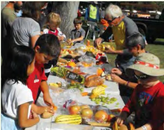
Fun making veggie cars during Car is King Weekend at Maryhill Museum of Art.