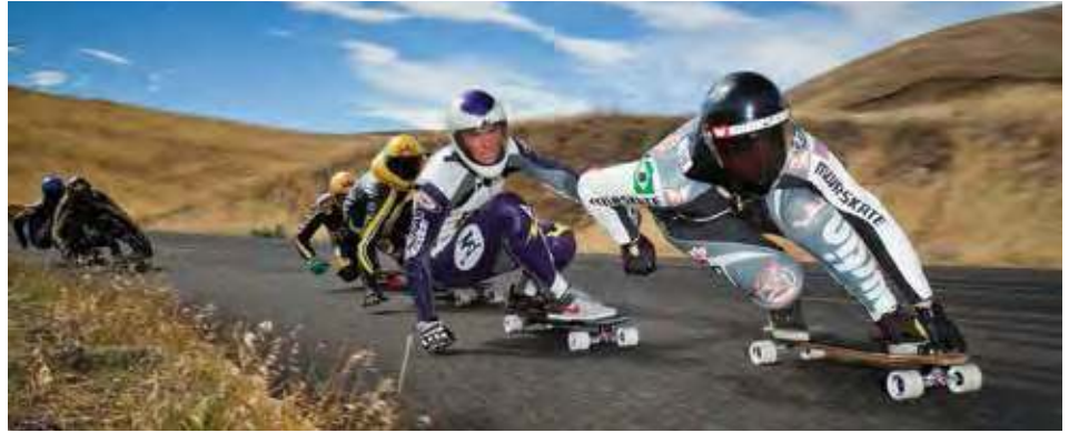
Racers roaring down the historic Maryhill Loops Road during the Festival of Speed.

Washington — Adams, Asotin, Chelan, Garfield, Douglas, Ferry, Grant, Kittitas, Mason, Lincoln, Pierce, Pend Oreille, Okanogan, Spokane, Stevens, Thurston, Whitman, and Yakima.