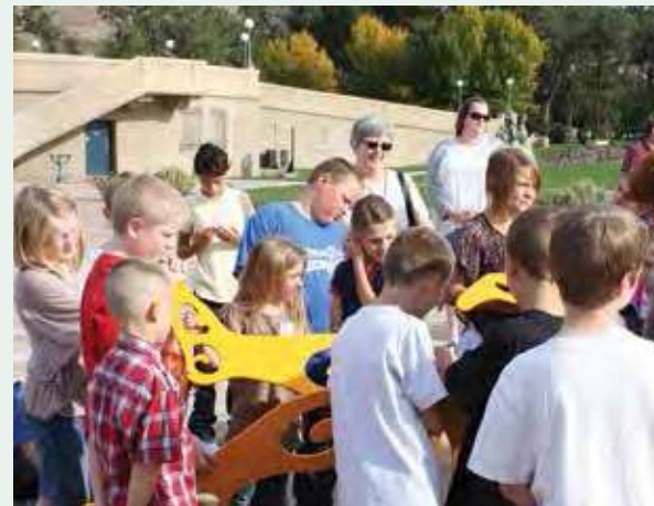
Learning about sculpture during a 2014 Museum Week program.