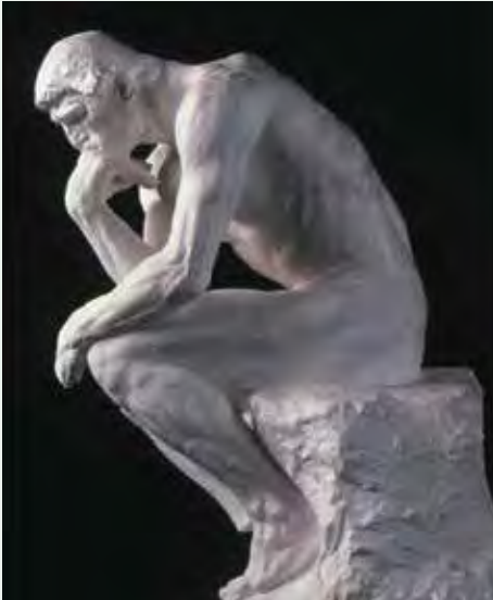
Auguste Rodin (French, 1840–1917). The Thinker , 1880. Plaster, 15" x 7½" x 7½"; Gift of Loïe Fuller, Collection of Maryhill Museum of Art.