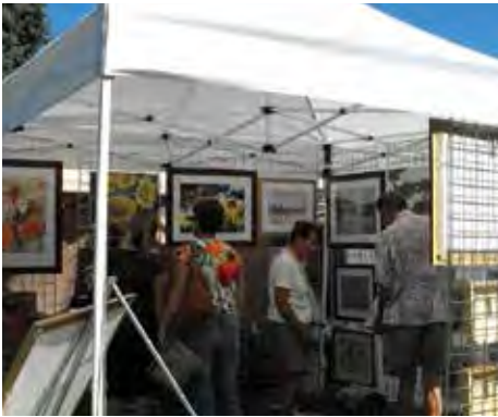
Maryhill Arts Festival attracts artists of all kinds. This year the Maryhill Arts Festival is part of the museum's Car is King Weekend.