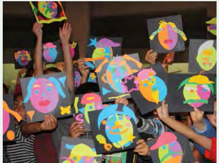
Self-portraits inspired by portraits in the museum.