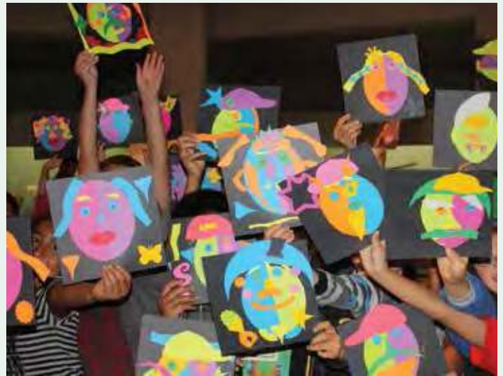
Self-portraits inspired by portraits in the museum.