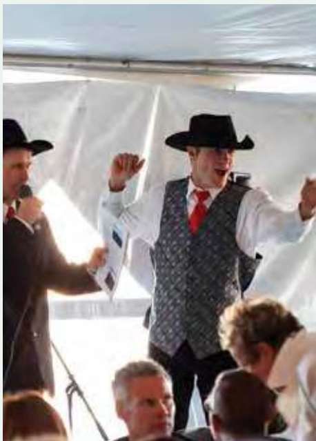
Auctioneers making a sale at the museum's 2014 benefit auction.