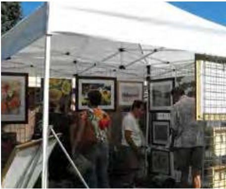
Maryhill Arts Festival attracts artists of all kinds. This year the Maryhill Arts Festival is part of the museum's Car is King Weekend.