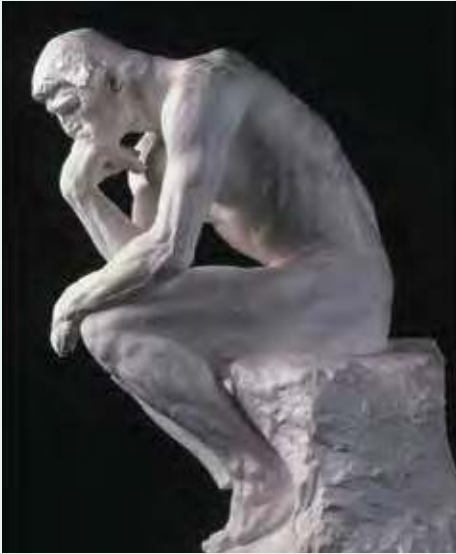
Auguste Rodin (French, 1840–1917). The Thinker , 1880. Plaster, 15" x 7½" x 7½"; Gift of Loïe Fuller, Collection of Maryhill Museum of Art.