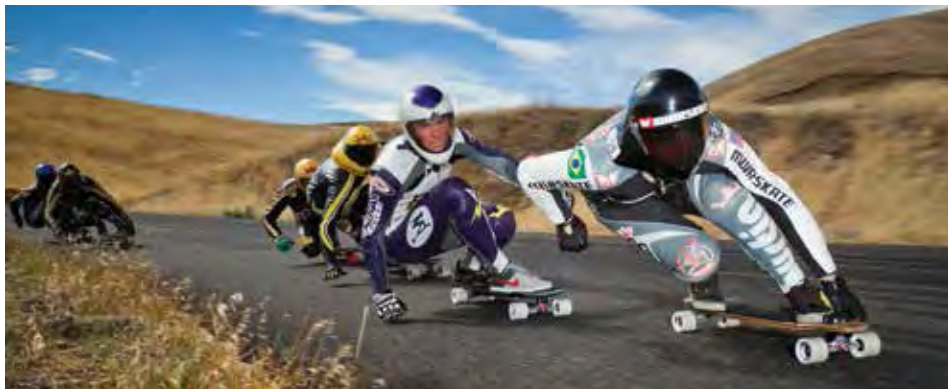
Racers roaring down the historic Maryhill Loops Road during the Festival of Speed.

Washington — Adams, Asotin, Chelan, Garfield, Douglas, Ferry, Grant, Kittitas, Mason, Lincoln, Pierce, Pend Oreille, Okanogan, Spokane, Stevens, Thurston, Whitman, and Yakima.