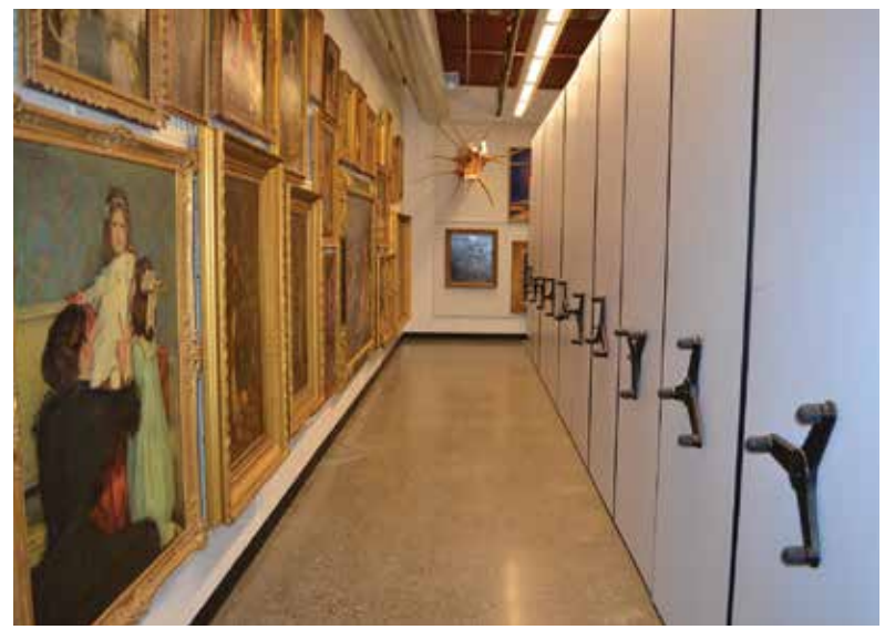
New painting racks and compact storage units in the Brim Family Research Center at Maryhill Museum of Art.

When the museum undertook its expansion project several years ago, one of the primary impetuses was to enlarge, centralize and upgrade storage of collections. At that time, the museum's nearly 20,000 objects were stored in awkward storage rooms scattered over three floors of the museum, making it difficult and inefficient to work with the collections. With the opening of the Mary & Bruce Stevenson Wing, for the first time in the museum's history, objects would be housed together in one location that is up to date with current museum standards.