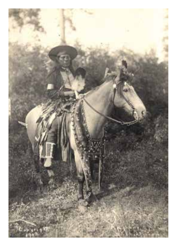
F.A. Young (American, 1862–1922), Charlie Pistolhead on Horseback, 1902; Collection of Maryhill Museum of Art

In anticipation of the 2016 centennial celebration of the Columbia River Highway, the Sam Hill Room hosts a temporary exhibition of black and white prints showing both construction of the highway and early scenic views of the Columbia River Gorge. Most of the images are drawn from Sam Hill's personal photo collection, which is housed at Maryhill Museum of Art.