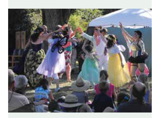
The July 18 & 19 Free Counties Weekend will include a free performance of Taming of the Shrew by Portland Actors Ensemble.

Oregon — Clatsop, Columbia, Grant, Lincoln, Morrow, Tillamook, Washington, Wheeler, and Yamhill. Washington — Clark, Cowlitz, Grays Harbor, Jefferson, Lewis, Pacific, San Juan, and Wahkiakum.