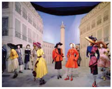
The late 1940s Théâtre de la Mode "La Rue de la Paix en la Place Vendôme" set (detail) by Louis Touchagues, as recreated by Anne Surgers, 1990.