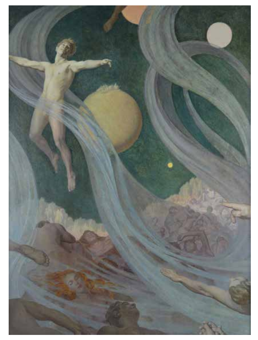
R.H. Ives Gammell (American, 1893–1981), The Night of Forebeing , 1962, oil on canvas, 31" x 23"; Collection of Maryhill Museum of Art