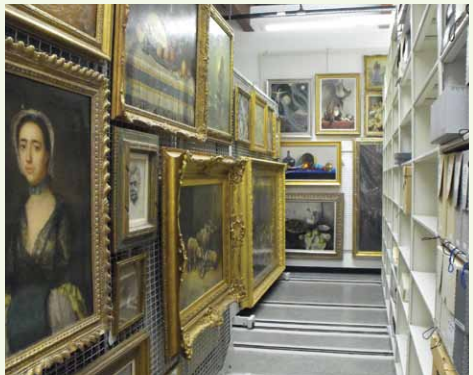
Maryhill's collections include nearly 20,000 objects and archival items.

This well-designed storage area, with compact storage systems, collections work rooms, and research areas, houses the museum's collections safely and efficiently, while providing improved access to objects. Each year researchers visit Maryhill to examine objects, study and occasionally publish their findings. Similarly, our own