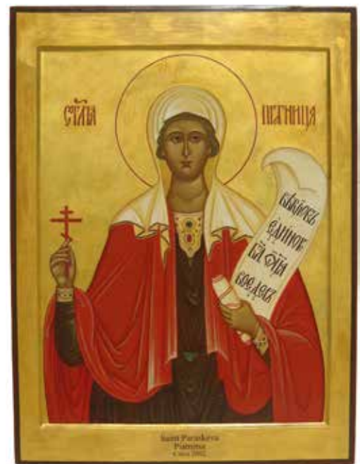
Alyona Knyazeva (Russian) Saint Paraskeva , 2002 Egg tempera on wood, 16" x 21" Museum of Russian Icons, Clinton, MA

We are thrilled to offer two in-depth workshops exploring two different art techniques. Both are appropriate for all skill levels.