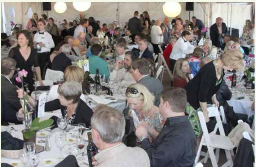
Guests enjoy the best locally grown foods and the Northwest's top wines at Maryhill's Best of the Northwest Dinner and Wine Auction.