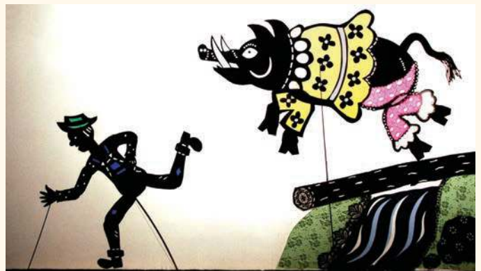
Oregon Shadow Theatre's Jack and the Dragon