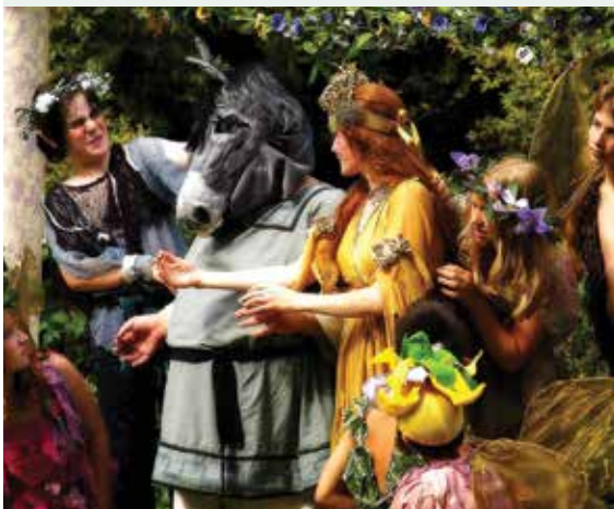
A Midsummer Night's Dream, Portland Actors Ensemble, Photo by Garry Louie.

Sponsored by Art Dodd and Diane Plumridge.