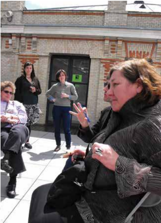
Top: Museum members pose before going into the Prado in Madrid.