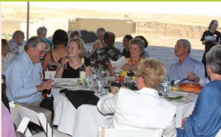
Guests at the 2013 Auction.

Bid on some of the region's best and most sought after wines, enjoy a fabulous meal made with local ingredients, and support your local art museum. You'll also have a chance to nab trips to Hawaii or the Pendleton Round-Up, an exclusive Maryhill Winery winemaker's dinner, a glassblowing tour of the Gorge, stargazing at Stonehenge, and much more. This event is always a rollicking good time and you'll not want to miss one minute of the fun.