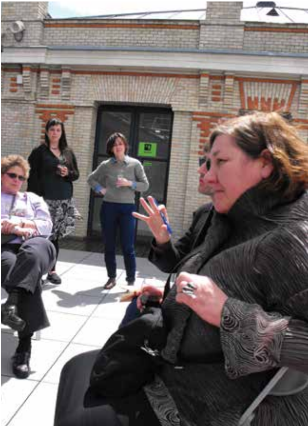
Top: Museum members pose before going into the Prado in Madrid.