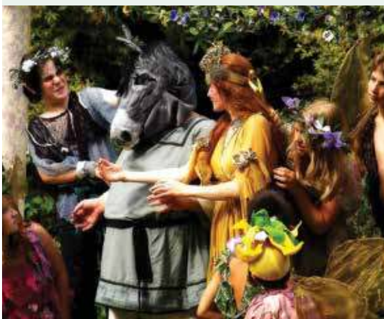
A Midsummer Night's Dream, Portland Actors Ensemble, Photo by Garry Louie.

Sponsored by Art Dodd and Diane Plumridge.