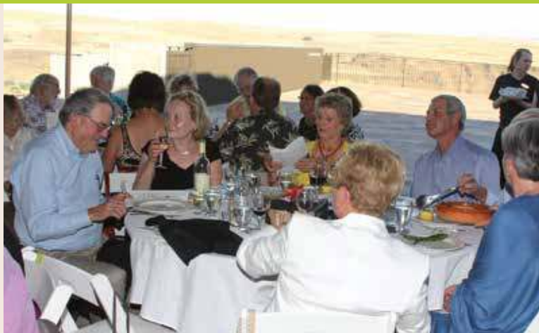
Guests at the 2013 Auction.

Bid on some of the region's best and most sought after wines, enjoy a fabulous meal made with local ingredients, and support your local art museum. You'll also have a chance to nab trips to Hawaii or the Pendleton Round-Up, an exclusive Maryhill Winery winemaker's dinner, a glassblowing tour of the Gorge, stargazing at Stonehenge, and much more. This event is always a rollicking good time and you'll not want to miss one minute of the fun.