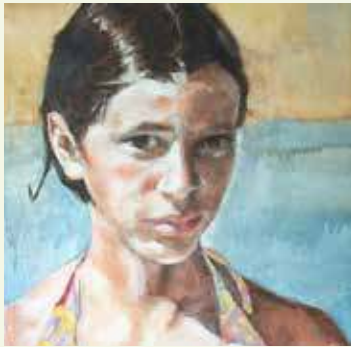
Jeanney McArthur, Little Sister, Big Summer , acrylic on canvas, 12"x12".

Artists of a common nation often reflect the values, beliefs, history and the personality of a people. If so, what is it in American art that makes it so unique? What makes a work of art "American"? How do some of our country's greatest paintings depict its rich history? Together we will explore these ideas and more. Join us!