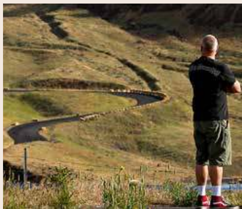
Contestants and spectators alike enjoy the 2012 Festival of Speed.