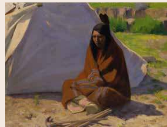
Eanger Irving Couse (American, 1866–1936), Umatilla Indian by the Columbia River , c. 1897, oil on canvas, 12" x 16"; Courtesy of the Eiteljorg Museum of American Indians and Western Art, Indianapolis

Cost for bus and lunch: $50 members/$55 non-members; to register call 509.773.3733.