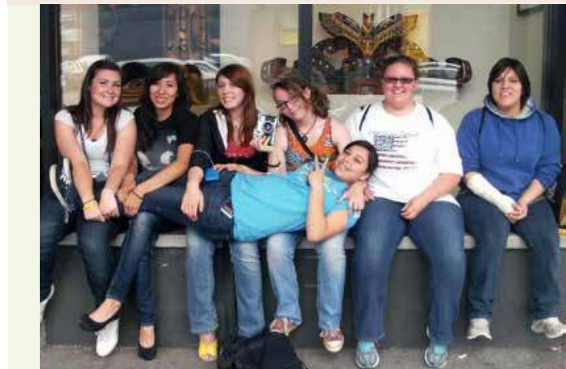
Participants in the Journeys in Creativity program celebrate outside Quintana Galleries in Portland, Oregon.