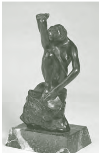
Auguste Rodin, Despair , c. 1880, bronze, 8¼” x 4¾” x 4⅞”. Bequest of Samuel Hill, Collection of Maryhill Museum of Art.