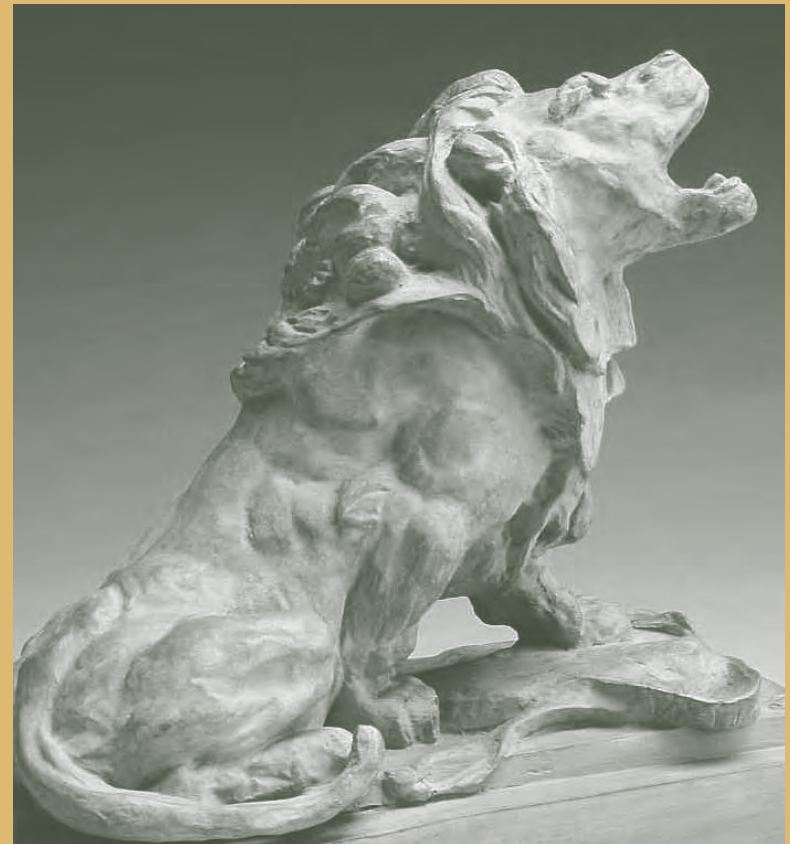
Auguste Rodin, Crying Lion (Lion de Belfort) , c. 1881, terra cotta, 11 1/8" x 13" x 6 1/8". Gift of Iris and Gerald B. Cantor, Collection of Maryhill Museum of Art.