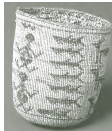
Wasco/Wishxam, Twined Sally Bag , late 19th century, Indian hemp, 6¾" x 4½" diameter. Gift of Mrs. H.E. Selby, Collection of Maryhill Museum of Art.

Look for bags with pictures of animals. These bags are made by weaving together long pieces of string, hide or other material. Twined bags were often used to store food and household items. Twined bags often have animal designs on them. Draw a bag with animals on it.