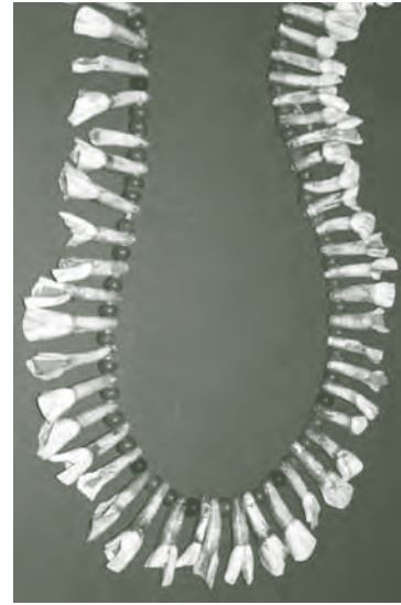
Columbia River Plateau, Animal Tooth Necklace , c. 1900, teeth, glass beads and cotton cord, 48" x 1¼". Collection of Maryhill Museum of Art.

Fun fact! Baskets are hard. Bags are soft!