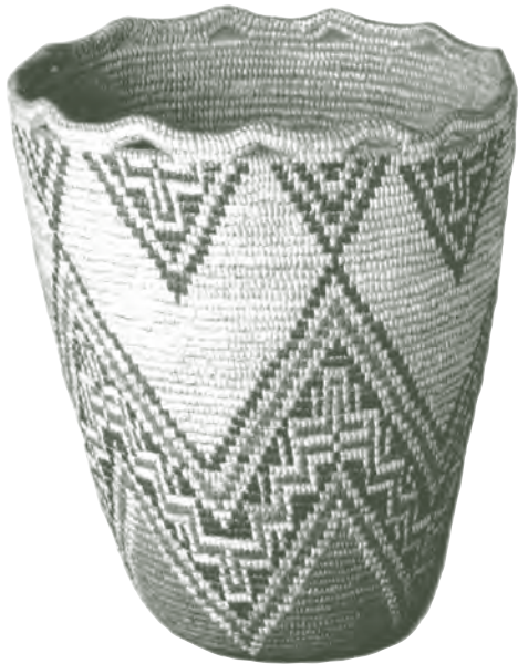
Klikitat, Coiled Berry Basket , c. 1900, cedar root bark and bear grass, 13½" x 10" diameter. Gift of Robert Campbell, Collection of Maryhill Museum of Art.

Before metal pots and pans, baskets were used for cooking and storing food.