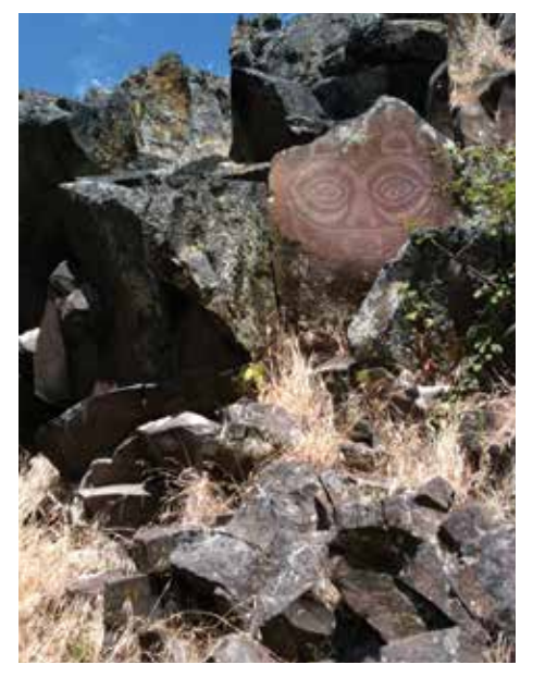
Tsagaglal (She Who Watches) at Columbia State Park.