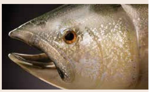
Raven Skyriver (American, b. 1982), Tyee (detail), 2014, off-hand sculpted glass, 19" x 5" x 32" overall; photo by KP Studios.

Black and white prints showing both construction of the highway and early scenic views of the Columbia River Gorge.