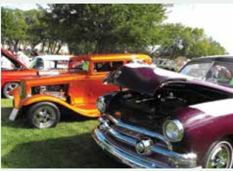
Left: The Maryhill Arts Festival Above: Concours de Maryhill 2014 Below: Creating veggie cars

Join in the fun at the annual Classic Veggie Car Races just for kids. Children can put their ingenuity to work transforming humble veggies into fantastically engineered cars and race them on a 12 foot ramp for thrills and chills. Kids of all ages are invited to participate in this FREE and fun outdoor activity. Races start at 1 p.m.